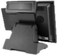
2 x 20 VFD