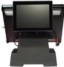
8" Touch Rear Display